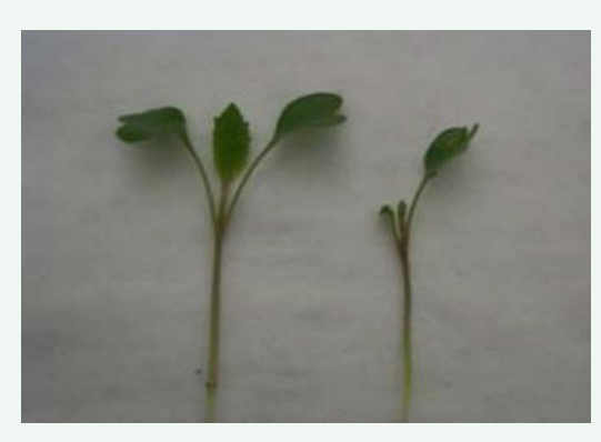
Normal seedlings of cauliflower (left) and abnormal seedlings of cauliflower (right).